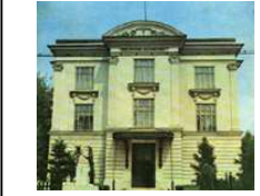
"V. A. Urechia" Library