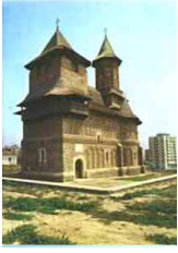
Holy Virgin Church (17 cent.)