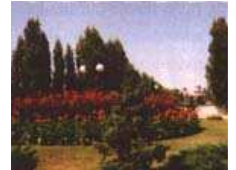
The Botanical Garden